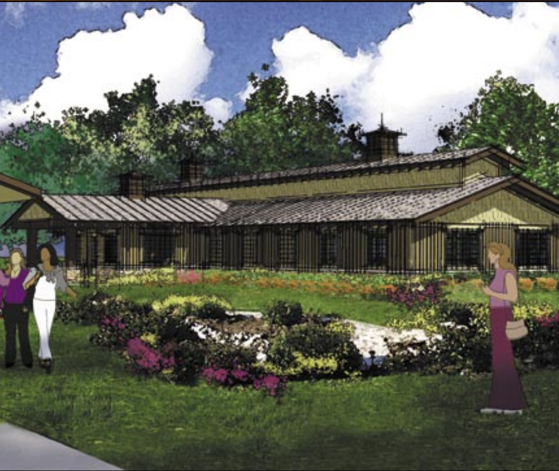
artist's rendering - therapy building